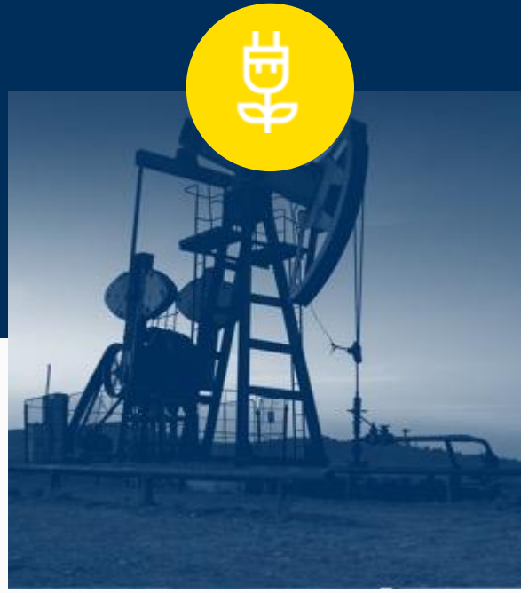
Energy, Infrastructure and Natural Resources